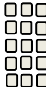
Fifteen (15) pouches

The pouches are then packaged in a polypropylene primary container. The primary container is shrink wrapped into five can rolls (i.e., secondary container). The shrink-wrapped rolls are packed into a corrugated cardboard case (i.e., tertiary container) containing 18 rolls per case, for a total of 90 cans per case.